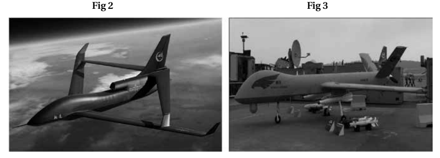
Soaring Dragon UAV

(Cai Hong) series of UAVs. Its latest UAV, CH-5 undertook its maiden flight in August 2015. Modelled on the US Reaper MQ-9 design, the CH-5 is the heaviest attack UAV. With a wingspan of 20 m, it has a 900 kg payload capability and weighs up to 3 tonnes.<sup>5</sup> The CH-5 is equipped with a wall penetrating radar enabling the ground station to identify targets behind walls or inside buildings, giving the UAV 80 km target detection capability. It can carry up to 8 AR-1 missiles and 2 FT-7 small diameter bombs<sup>6</sup> while having up to 1,000 km operational range and flight endurance of 30 hours. Its predecessor, the CH-4 can carry over 350 kg of armament with five AR-1 missiles and two FT-5 bombs. It has a take-off weight of 1.3 tonnes and a wingspan of 18 m. A CH-4 UAv was used by the Iraqi Air force to destroy an ISIS gun position in the Battle of Ramadi on December 06, 2015. The other notable recent UAVs the Chinese inventory are the Soaring Dragon and Wing Loong II. The Wing Loon II UAV was showcased in September 2015 and can carry 12 air-to-surface missiles. Having an operational ceiling of over 9,000 ft, it has a payload capacity of 480 kg. The Soaring Dragon has an operational ceiling of 60,000 ft and is being developed for both intelligence gathering and armed roles.